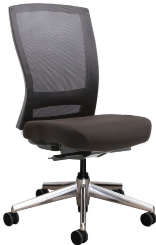
Buro Mentor chair with polished base