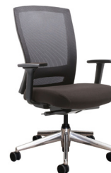
Featured with arms

The Buro Mentor offers the latest in contemporary and ergonomic design. The Mentor is a stand out candidate for any board room, office or home office environment. Featuring a complete range of ergonomic features, easy to use synchronised seating adjustments and outstanding comfort.