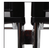
Envy with heavy-duty linking system (Indent only)