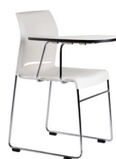
Envy with Tablet, white (Indent only)