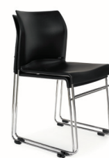
Envy stacked, black